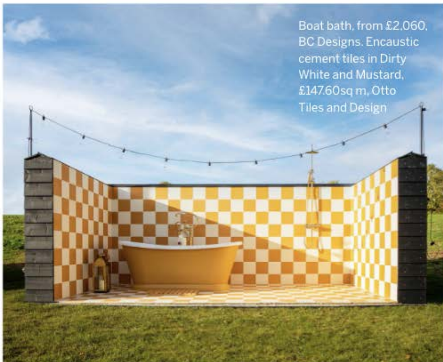
Boat bath, from £2,060, BC Designs. Encaustic cement tiles in Dirty White and Mustard, £147.60/sq m, Otto Tiles and Design

Take outdoor bathing to the next level by creating a fully tiled 'room' that's easy to keep clean and unforgettable. 'There really is nothing better than bathing outside, overlooking an amazing view,' enthuses Cat Earp, owner of boutique shepherd hut retreat Aller Dorset (right). 'We put outdoor baths in our original huts as a nice alternative to hot tubs, and they were a huge hit. For our latest huts we wanted to make them even better – tiling the whole space really makes it feel like a bathroom without a roof,' she says.