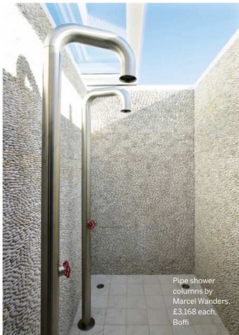
Pipe shower columns by Marcel Wanders, £3,168 each, Boffi

Concerned that showering outdoors will prove little more than a pipe dream for most of the year? New York-based West Chin Architects devised the perfect solution for this outdoor shower at a Long Island beach house, which has a retractable skylight that can be closed when blue skies turn grey. Walls clad in stacked river pebbles and travertine flooring enhance the connection to nature, whether the roof is open or shut, while two of freestanding shower columns in stainless steel lend a smart industrial touch.