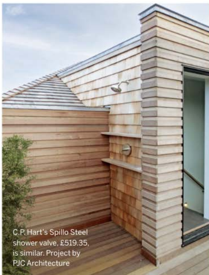
C.P. Hart's Spillo Steel shower valve, £519.35, is similar. Project by PJC Architecture