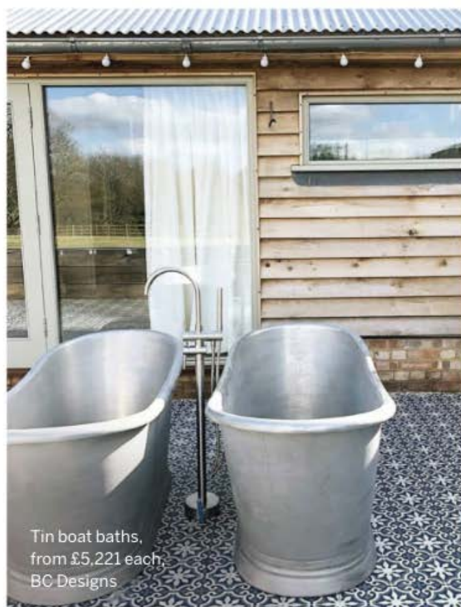
Tin boat baths, from £5,221 each, BC Designs

Installing two outdoor baths may seem extravagant but it can prove a more hygienic way to enjoy the sociable benefits of a hot tub. 'This boat bath duo is the perfect set-up for watching the sunset in company, without having to squeeze into the same tub or share water,' says Barrie Cutchie, design director, BC Designs. 'Tin is a great material for outdoor baths – it retains heat well and can be left outdoors year round.' →